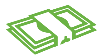
The College Board's Trends in College Pricing, 2012